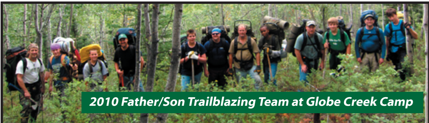
2010 Father/Son Trailblazing Team at Globe Creek Camp

In 2010, LightShine Ministries sent 8 teams to different assignments with the goal of building up the Body of Christ and building His Kingdom. We obeyed the Lord with what He put in our hearts. Now He is putting things in the hearts of others and the vision is expanding. This process is very exciting! After our last team finished their work (pictured above), Freedom in Christ Ministries in North Pole contacted us and informed us that they want to give us a one acre property in order to build our first missionary base in Alaska. Needless to say, we are very excited about this new vision for 2011. Now we are seeking the Lord for wisdom and His provision in how we will raise the capital needed to build our own building suitable for housing our teams. This is a great need.